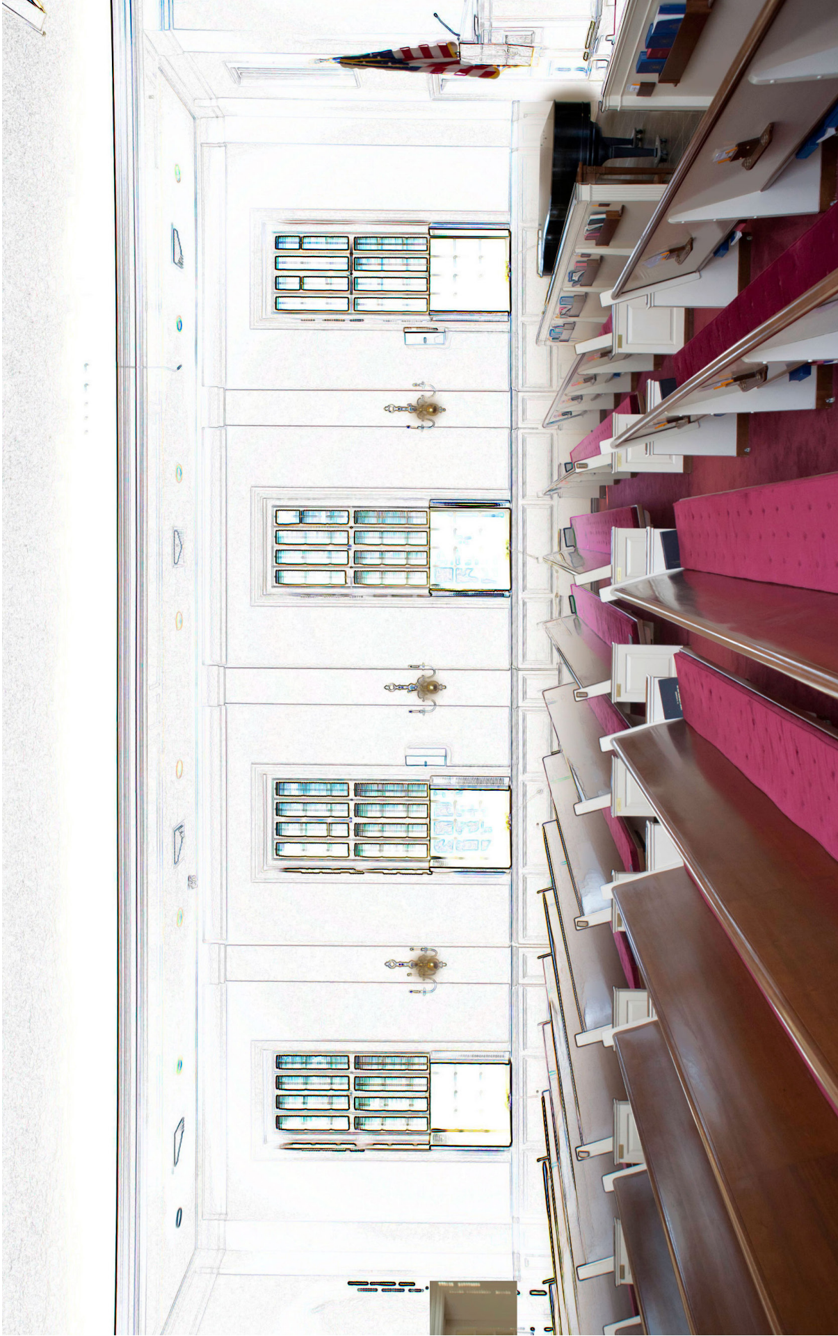
Do-it-Yourself Sanctuary Design Pages